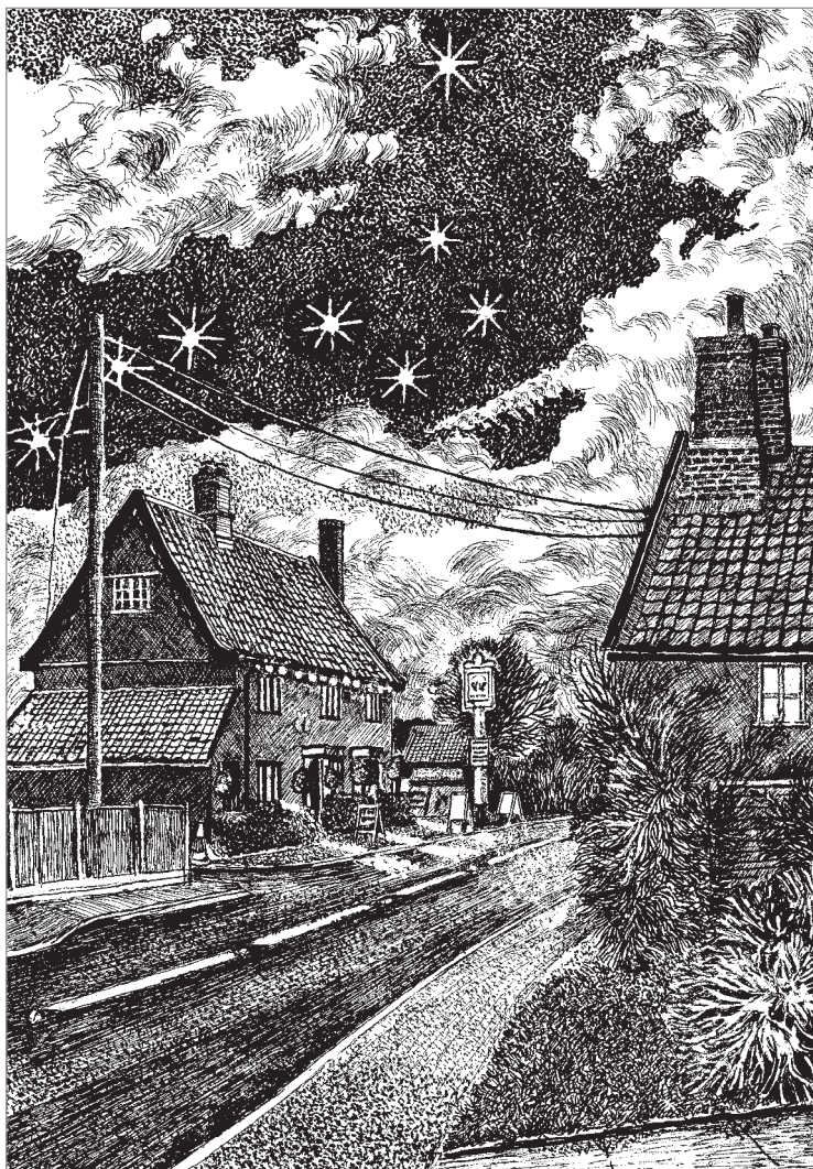
The Inn and the Star, Winfarthing